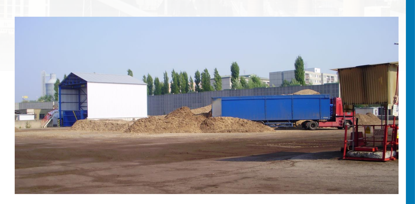
Biomass unloading yard

CFB boiler conversion from coal to biomass firing including design, manufacturing, site delivery and commissioning of biomass receiving and unloading area, screw conveyors, silos, conveyor scale and boiler management system modification.