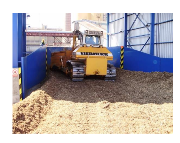
Biomass receiving area with underground screw conveyors